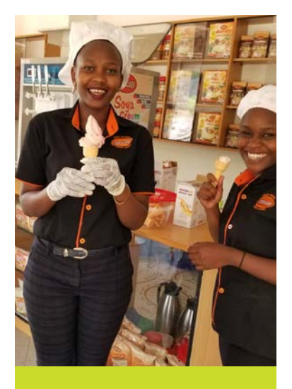
SESACO exemplifies the enthusiasm for U.S. soy and its nutritional power for breads, beverages, school meals and more. In April, SESACO introduced frozen soy dessert, a first for Uganda and quite possibly the entire East African region.

Demand for high-quality soy protein products like defatted soy flour and TSP opened the door for trade. "We can't produce these products at home, so we better import them from the USA so we can address two main challenges: One is nutrition and the other is economic," Nsubuga said.